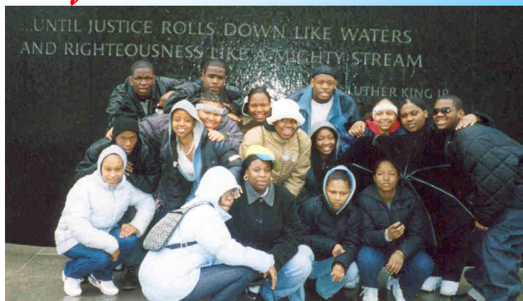
Umoja Seniors before the Martin Luther King, Jr. memorial in Montgomery.

The school year has truly flown by and we are on the verge of watching the class of 2003 walk across the stage to receive their diploma. Our seniors stroll through the halls, taller, surer, braver than they were four years ago. They are still so young, so much fear mixed with their excitement about graduation plans. We are proud to have been part of their growth, their expanded vision and sense of self over these last few years. Truly, it is an honor to know that the relationships we have built with them will continue for years...that we will walk beside them through the next phase of their life as well, whether that is college, a job, or both. Over time those relationships will become more mutual, these same young adults will come back to Manley to serve as college and career mentors for the next generation. As the more than 60% of the class of 2001 and 2002 attend colleges and universities all over the country, they helped build this college culture, so different from the reality four short years